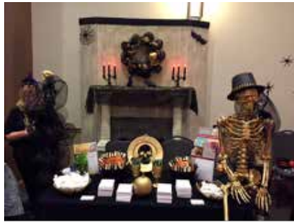
Encompass Home Health