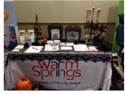
Warm Springs Specialty Hospital